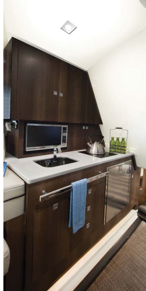
The fully equipped galley in the 360SC is to starboard. Note the entry to the aft cabin.

The Monterey 360 SC is a great example of a stylish and functional mid-size express cruiser with ample room for entertaining crowds on a day trip, yet still comfortable enough for cruising. If you're looking to spend quality time on the water with family and friends while surrounded by luxuri-