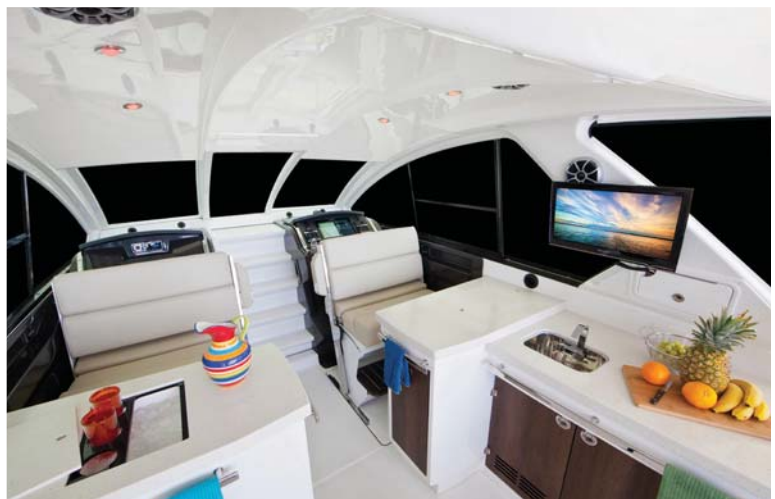
The upper cockpit features two facing bar areas.