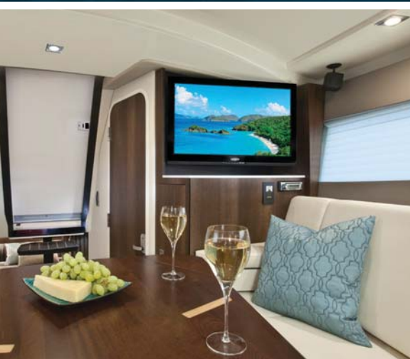
Looking aft to the head from the bow dining area.

For protection from the elements, the 360 SC comes standard with a fiberglass hardtop enclosure, complete with electric side windows. A most notable feature is the patent-pending, electronic windshield that retracts into the hardtop to allow passengers and crew direct access to the