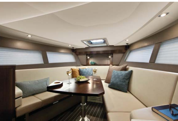
The 360SC's bow dining area is open and spacious.